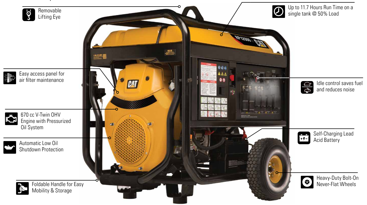
Because of continuing improvements, actual product may differ slightly from this photo.