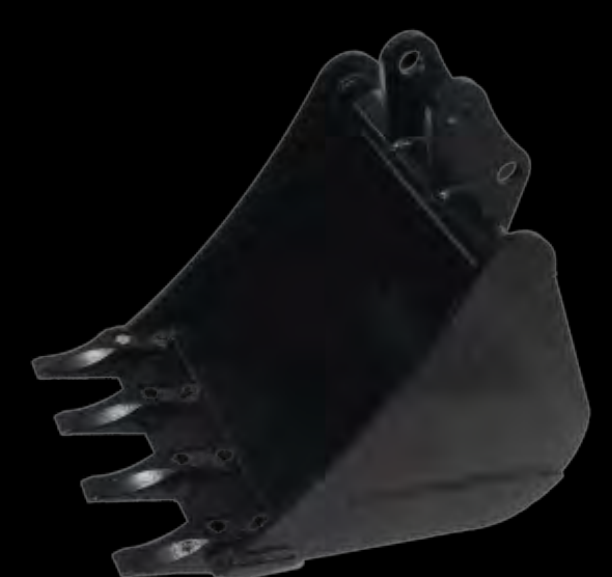
18 IN BUCKET