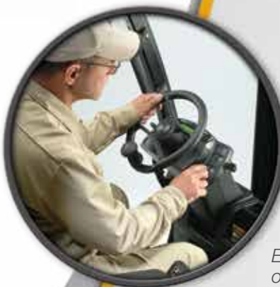
Excellent operator comfort