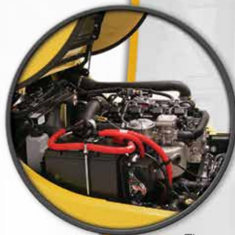
Three engine and two transmission selections available (PSI 2.4L LPG shown)