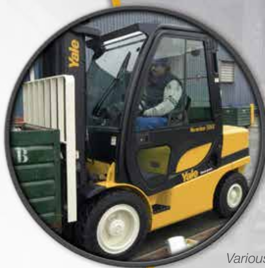
Various truck configurations

Two Yale transmission selections are available: the Standard Electronic Powershift and the Techtronix 100. Both transmissions feature smooth electronic inching, electronic shift, and neutral start/brake interlock. The Techtronix 100 transmission also maximizes controlled ramp descent limiting roll to three inches per second.