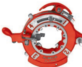
No. 714 & No. 914