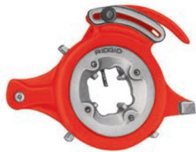
No. 711 & No. 914