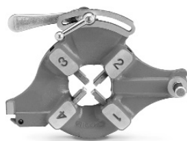
No. 713 & No. 913