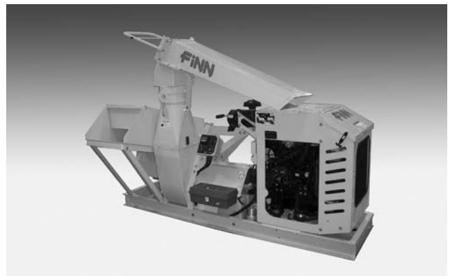
B70, Right Hand Feed, Straw Blower Skid Mounted. (B70S)

As the world leader for over 70 years in the design and manufacture of innovative, quality equipment for the erosion control industry, FINN Corporation is committed to your complete satisfaction.