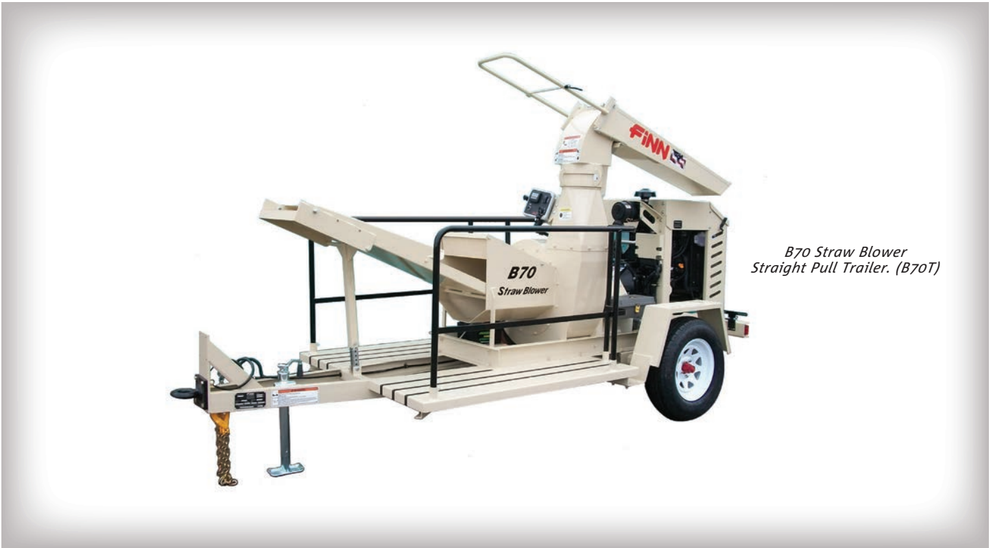
B70 Straw Blower Straight Pull Trailer. (B70T)

The FINN B70 Straw Blower is an ideal performer for all mid-size mulching needs. Designed to handle a wide variety of mulching material, the B70 gives you the high productivity and dependability that is essential for tackling home sites, industrial and commercial projects, and highway roadsides.