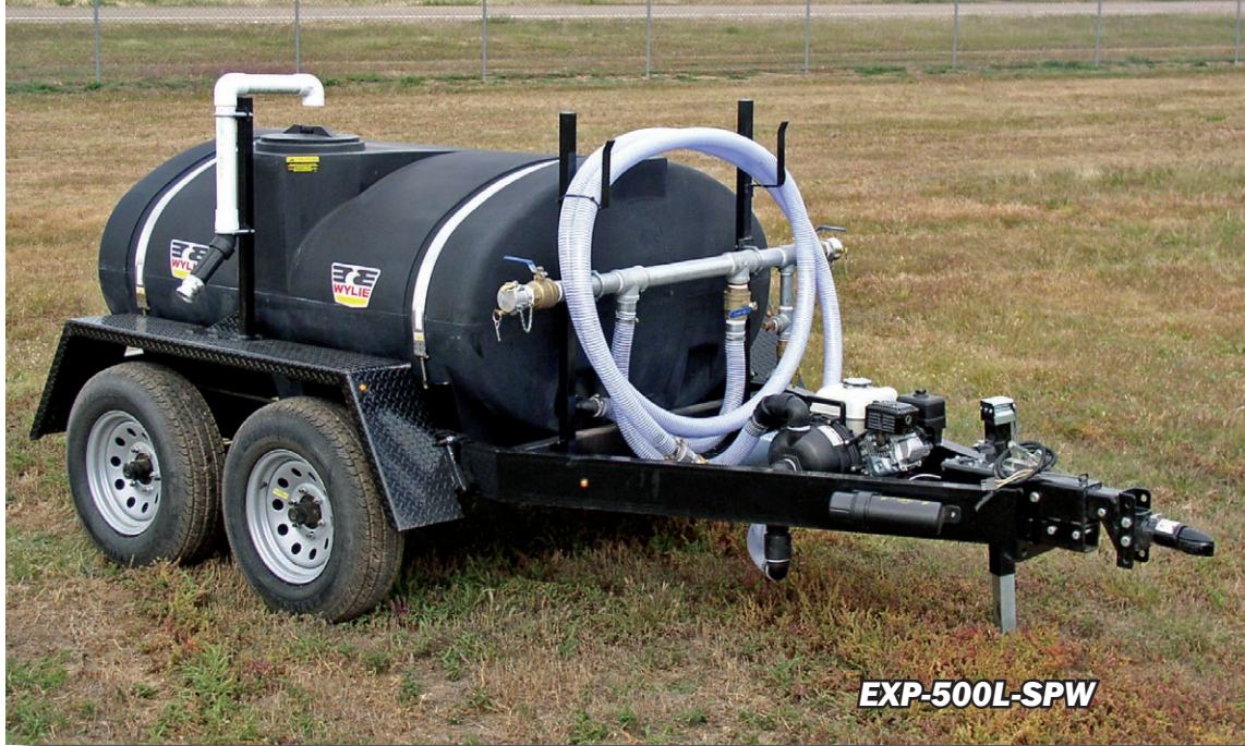
500 Gallon “Express” Potable Water Trailer (non-certified) All components of this non-certified trailer are rated for potable water.